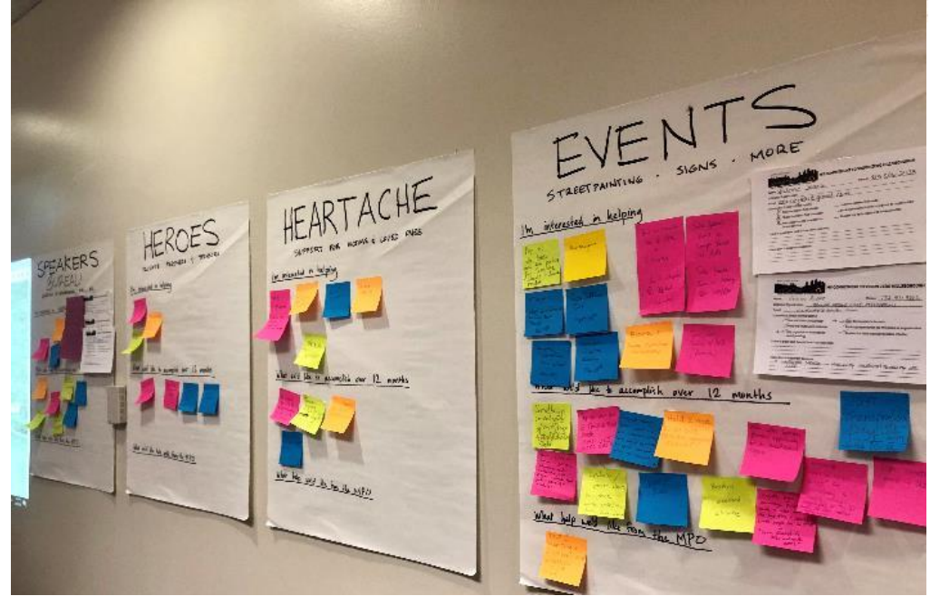
STOP! Give Light to Life! - Melissa Wandall