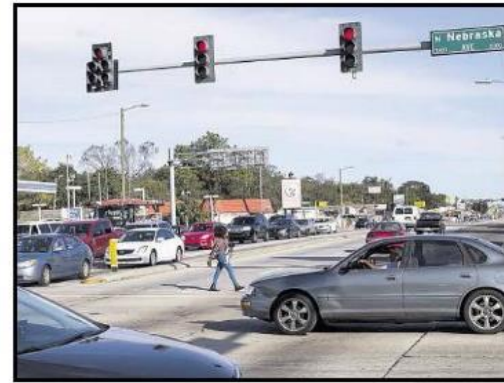
The 2015 deaths made Hillsborough County the most deadly place to walk in Tampa Bay.

Market still faltering The Dow Jones Industrial Average fell another 100 points, continuing the week's decline in the S&P 500. Analysts say the market is still in a state of uncertainty.