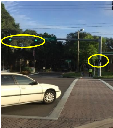
5 seconds later